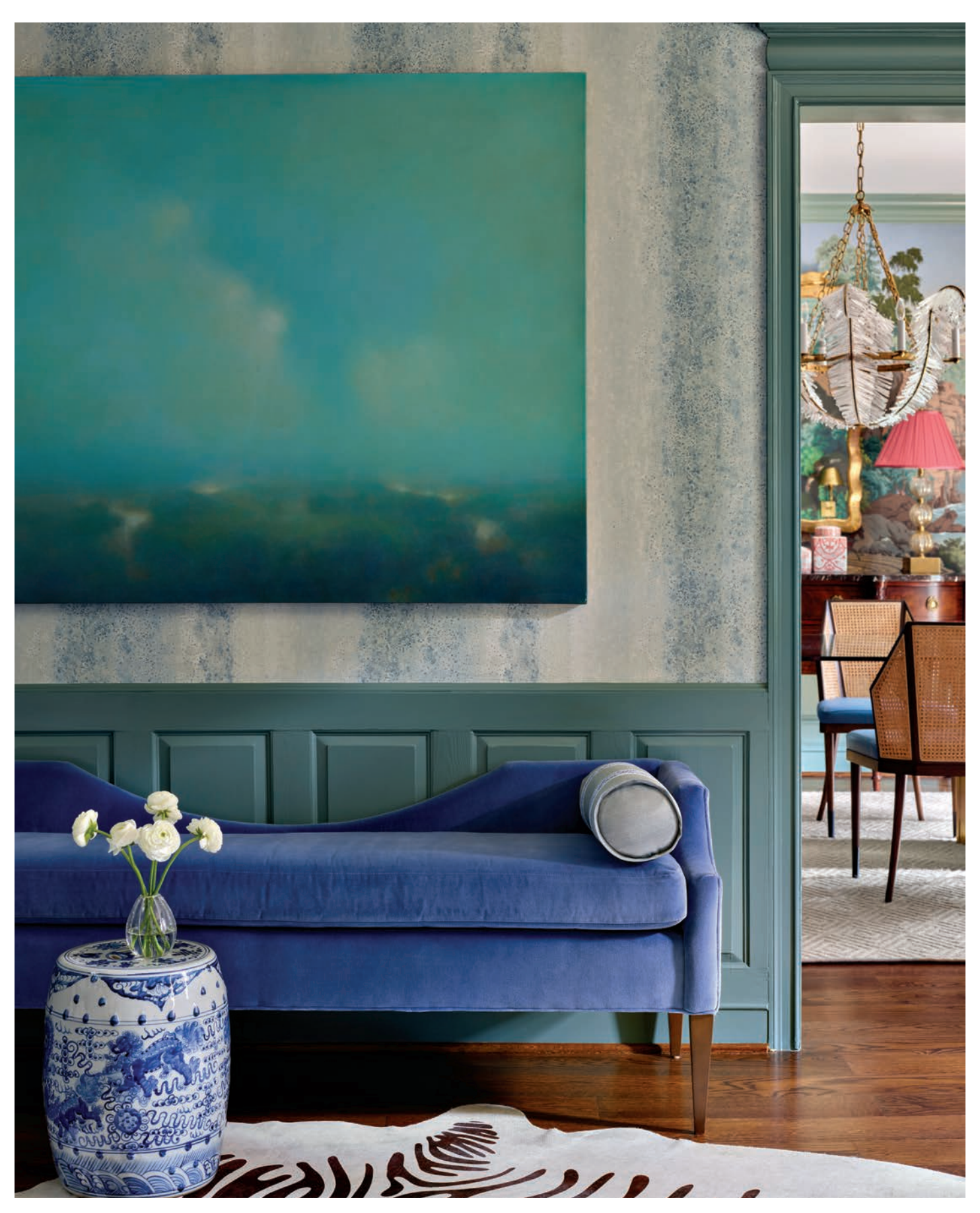
Interior Design: Courtney Giles, Courtney Giles Interiors